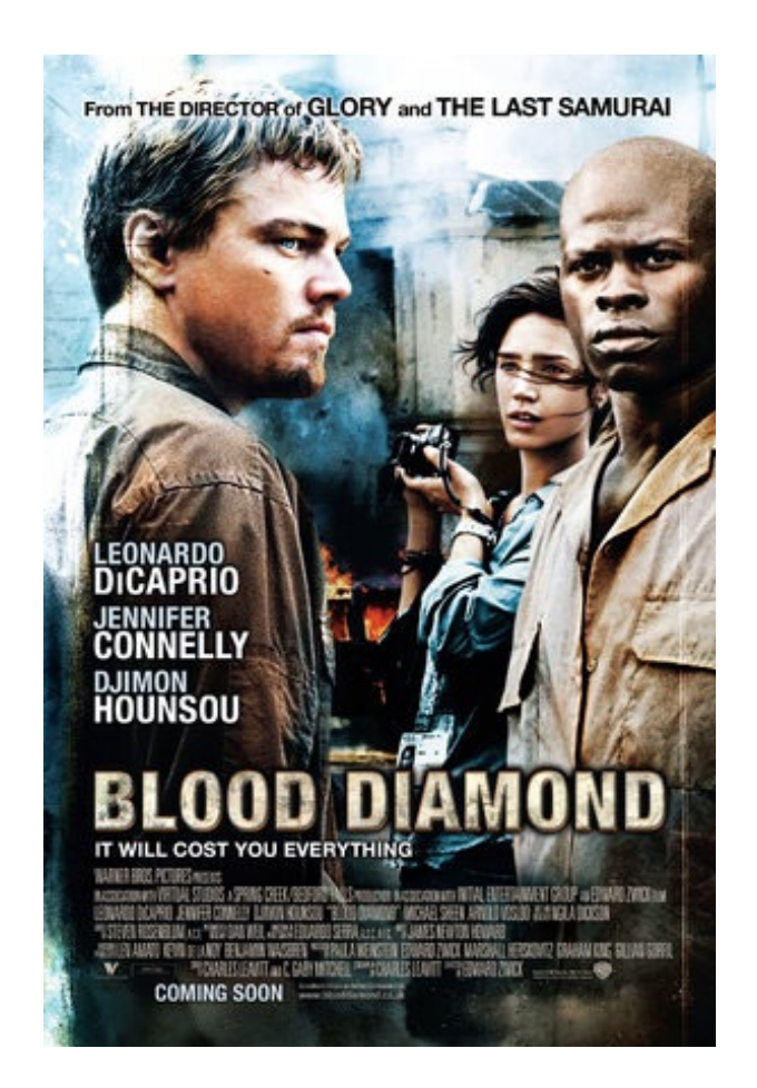
FIGURE 3. Blood Diamond (Edward Zwick, 2006). The poster of the movie is divided in two: the left shows the white hero, and you can see the other two protagonists on the right. There is no emphasis on the conflict of the blood diamonds or their victims.