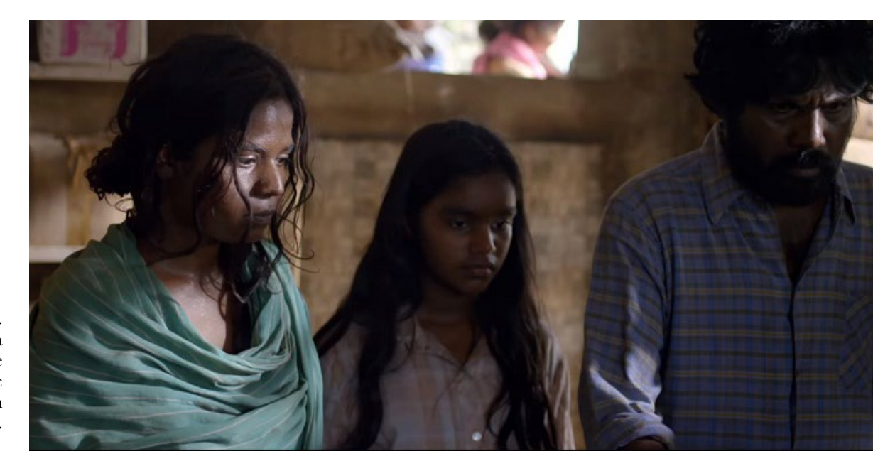
FIGURE 2. Dheepan (Jaques Audiard, 2015). The movie tells the story of an ex-guerrilla from Sri Lanka who arrives in France and faces the social problems within the country. The film won the Golden Palm in the 2015 Cannes Film Festival.

in big-budget cinema. This type of cinema is usually made in Hollywood, since the world's major cinema producers are based there, case in point: Warner Bros, Walt Disney Pictures, Universal Studios, 20th Century Fox, to mention but a few, and their content is consumed all over the planet.