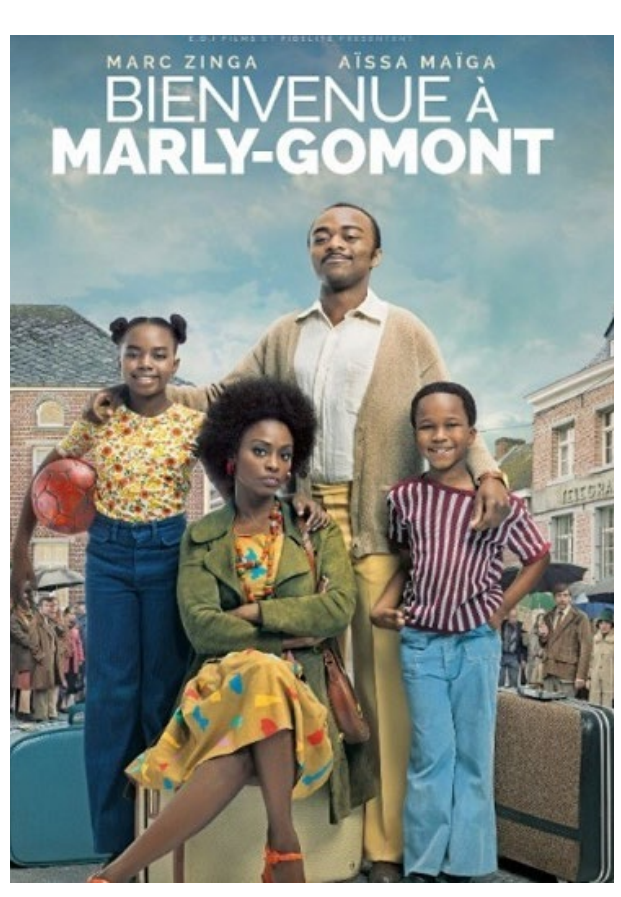
FIGURE 4. The African Doctor ( Bienvenue à Marly-Gomont , Julien Rambaldi, 2016). The poster shows a Congolese family surrounded by French people who stare at them in surprise from a distance.

FIGURE 3. Blood Diamond (Edward Zwick, 2006). The poster of the movie is divided in two: the left shows the white hero, and you can see the other two protagonists on the right. There is no emphasis on the conflict of the blood diamonds or their victims.